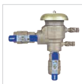
Vacuum Breakers for Irrigation Systems