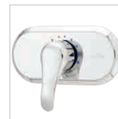
Thermostatic/Combination Shower Valves