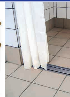
Stainless steel shower channel drains