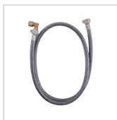
Anti-Microbial Water Connectors