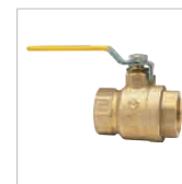
UL/FM Ball Valves