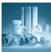
RO, Distilled Water & Deionized Water Piping