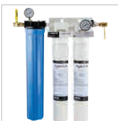
Water Filtration Systems

The Watts Water family of companies can help ensure safe & efficient foodservice operations for healthcare facilities and hospitals. Products and solutions range from water filtration systems for ensuring safe & great-tasting beverages to drains & floor sinks, gas connectors & safety systems, and a full line of faucets, pre-rinse units, and glass fillers.