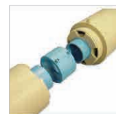
Double-Containment & Acid Waste Piping