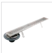
Shower Channel Drains

The Watts Water family of companies offers a variety of products & solutions designed to both safeguard patients & staff and ensure comfort at every level. This includes high-quality plumbing solutions designed for use “behind the wall” as well as visible products for showers, sinks, and bathtub areas.