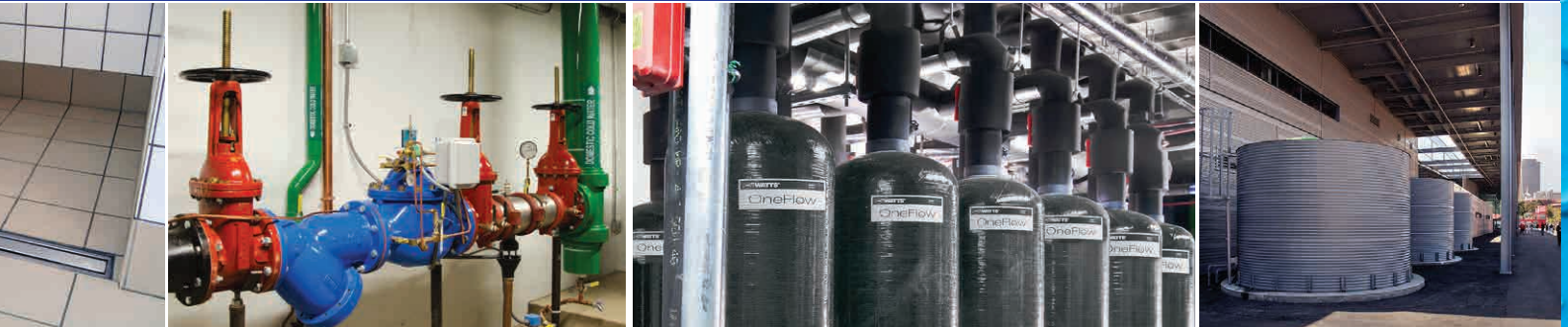
Flood protection shutdown valves