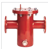
UL/FM Fire Service Strainers