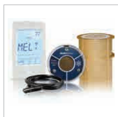
Snow Melting Systems

The Watts Water family of companies offers a range of solutions for outdoor and underground applications, whether that involves melting snow or ice on helipads, parking lots, or walkways or providing irrigation for landscaping and healing gardens. Many of our solutions are designed to help earn LEED credits and fulfill green objectives.