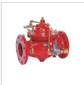
Automatic Control Valves