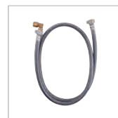
Anti-microbial Water Connectors