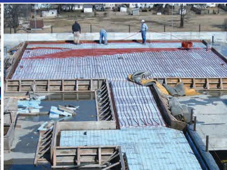
Snow melting systems for helipads