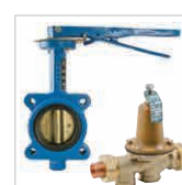
Gate, Globe, Check, Ball, Butterfly, Balancing, Pressure Reducing, & Relief Valves