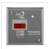
High Temperature Alarm & Shut-Downs

The Watts Water family of companies offers a range of solutions for mechanical rooms. Examples include pH monitors and neutralization tanks, water softeners, anti-scale systems, backflow preventers, pipeline strainers, and a wide range of valves, including gate, globe, check, ball, butterfly, balancing and relief valves.