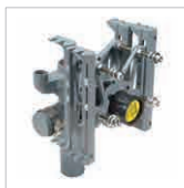
Bariatric Fixture Carriers