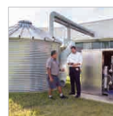
Rainwater Harvesting Systems