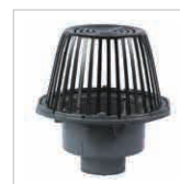
Cast Iron Roof Drains