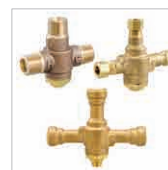
Lavatory Tempering Valves