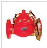
Fire Pump Relief Valves