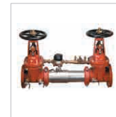
Double Check Detector Assemblies