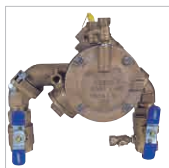
Backflow Preventers for Irrigation Systems