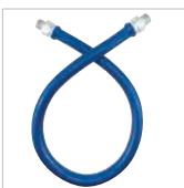
Gas Connectors & Safety Components