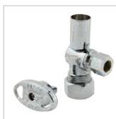
Water Supply Stops with Loose Key Handles