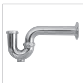
Commercial P-traps & Grid Drains