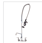
Faucets, Pre-Rinse Units & Glass Fillers