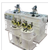
pH Monitors & Neutralization Tanks