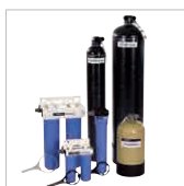
OneFlow® Anti-Scale Systems