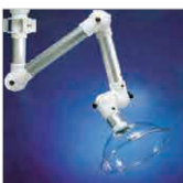
Alsident Exhaust Systems