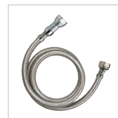
Water Connectors with Flood Protection