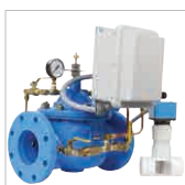
Flood Protection Shutdown Control Valves