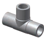
Polystar™ Polypropylene Piping