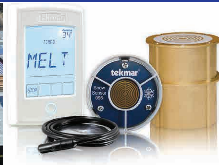
Snow melt controls