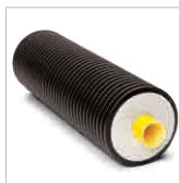
Insulated Piping Systems