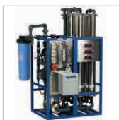
Water Filtration for Sterilization