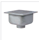
Stainless Steel Floor Sinks