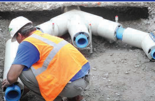
Double-containment piping systems