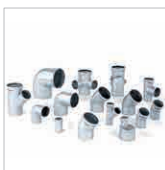
Stainless Steel Pipe & Fittings