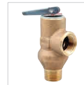
Fire Pressure Relief Valves