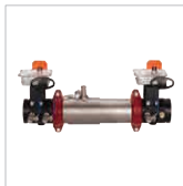
Double Check Valve Assemblies