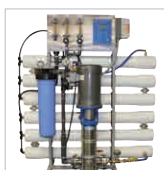
Water Filtration Systems