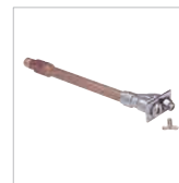
Freeze-Resistant Wall Hydrants