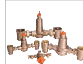
Emergency Tempering Valves for Eye Washes & Drench Showers