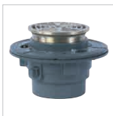
Floor & Sink Drains