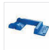
Appliance Positioning Systems