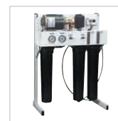
Water Softeners & Filters